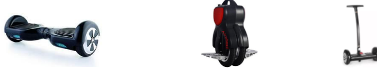
Examples of Self balancing devices